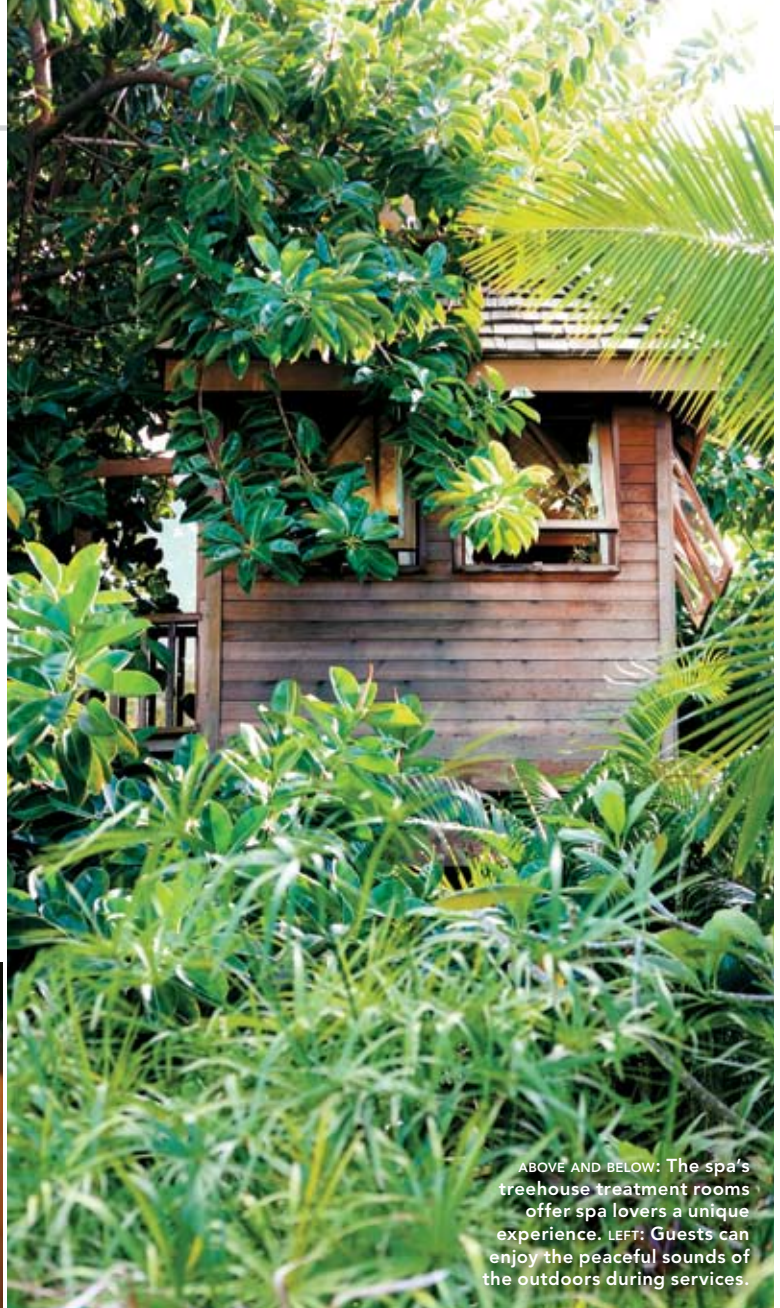
ABOVE AND BELOW: The spa's treehouse treatment rooms offer spa lovers a unique experience. LEFT: Guests can enjoy the peaceful sounds of the outdoors during services.

Also, taking a natural approach, the spa's signature skincare line, which was developed locally, offers a taste of the islands. In addition to different types of monoï , including pineapple and vanilla, the product line offered at Marù features a series of scrubs that combine fruit, organic sugar, sand, and semi-precious stones to treat the skin and provide spa-goers with an undeniable sense of place.—C.D.