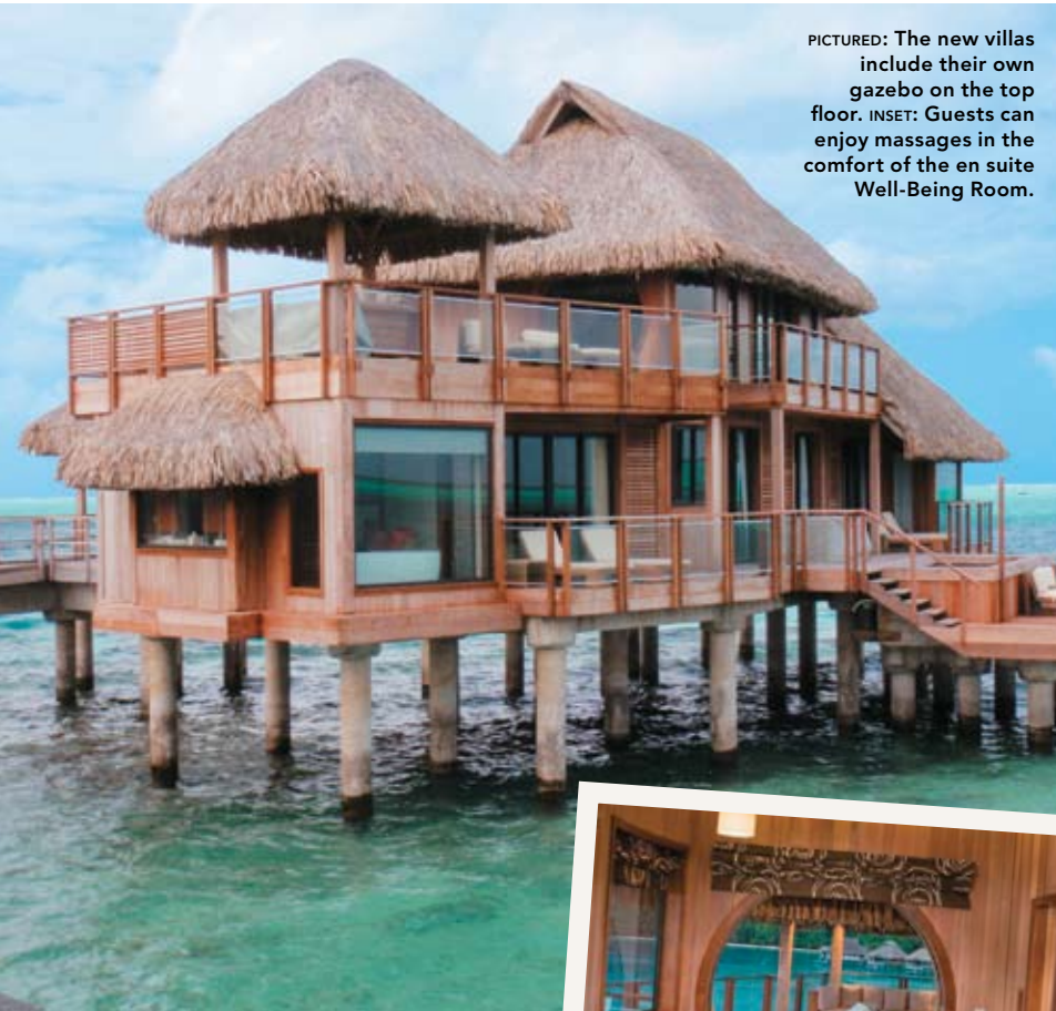
PICTURED: The new villas include their own gazebo on the top floor. INSET: Guests can enjoy massages in the comfort of the en suite Well-Being Room.