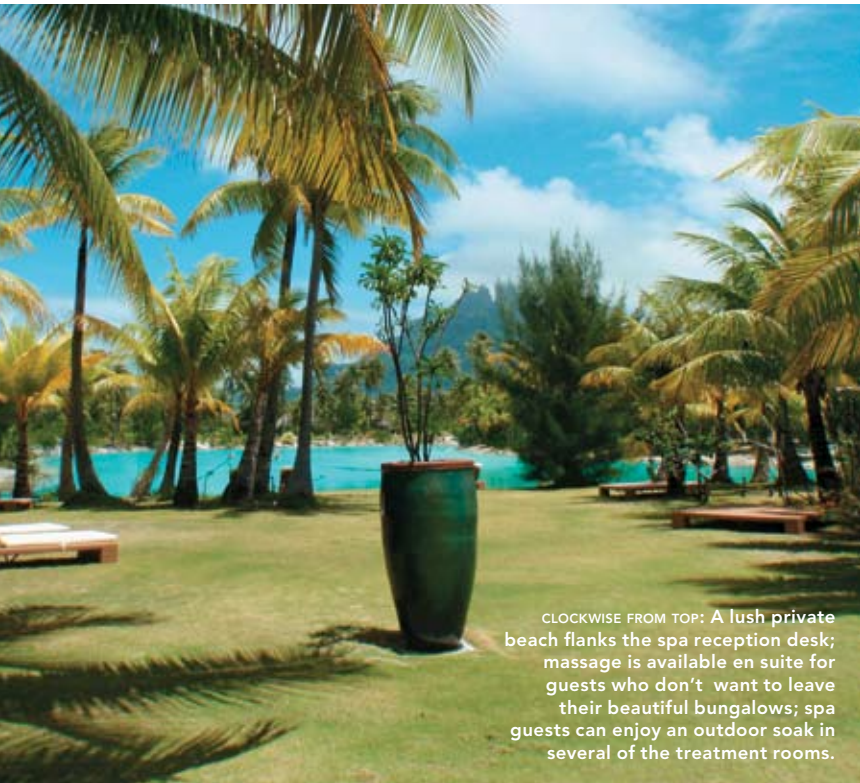
CLOCKWISE FROM TOP: A lush private beach flanks the spa reception desk; massage is available en suite for guests who don't want to leave their beautiful bungalows; spa guests can enjoy an outdoor soak in several of the treatment rooms.