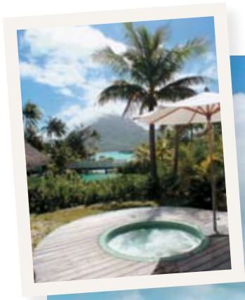
INSET: The spa features a handful of outdoor private whirlpools to maximize relaxation time. PICTURED: The resort is perfectly positioned for guests to take in the view of Mount Otemanu, no matter where they are on property.

Guests can also enjoy the outdoor co-ed relaxation area while still taking in the benefits of seawater through a hydrotherapy circuit, which includes whirlpools, a Swim Spa in which people feel like they are swimming against ocean currents, and a revitalizing Deep Chiller Walk. For spa guests who want to kick back while staying dry, one of the rowdiest areas on property is ironically one of the most soothing—honoring its roots, the spa has an indoor relaxation area that faces the roaring ocean.— C.D.