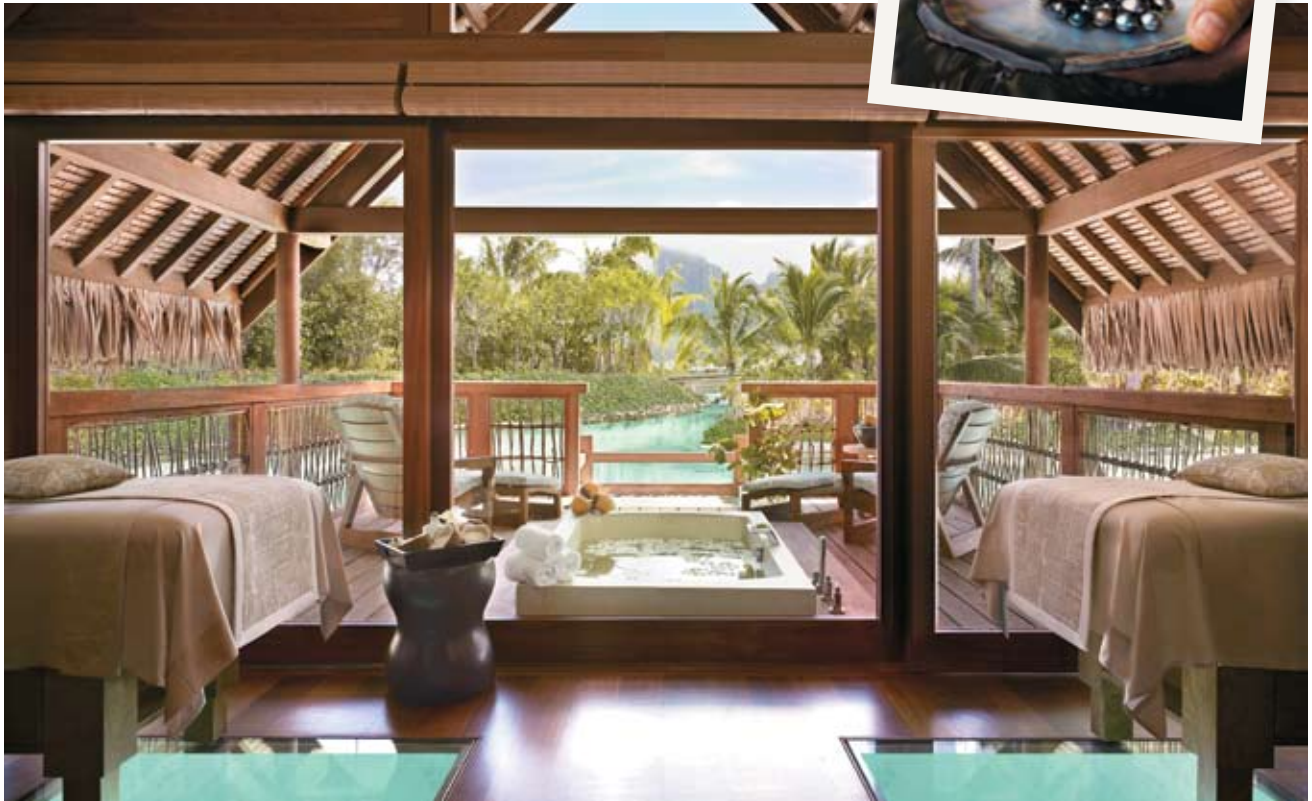
FROM TOP TO BOTTOM: Powder derived from black pearls is used to exfoliate; the Kahaia Spa Suite offers great sights both inside and out; the spa's main corridor is an architectural masterpiece.