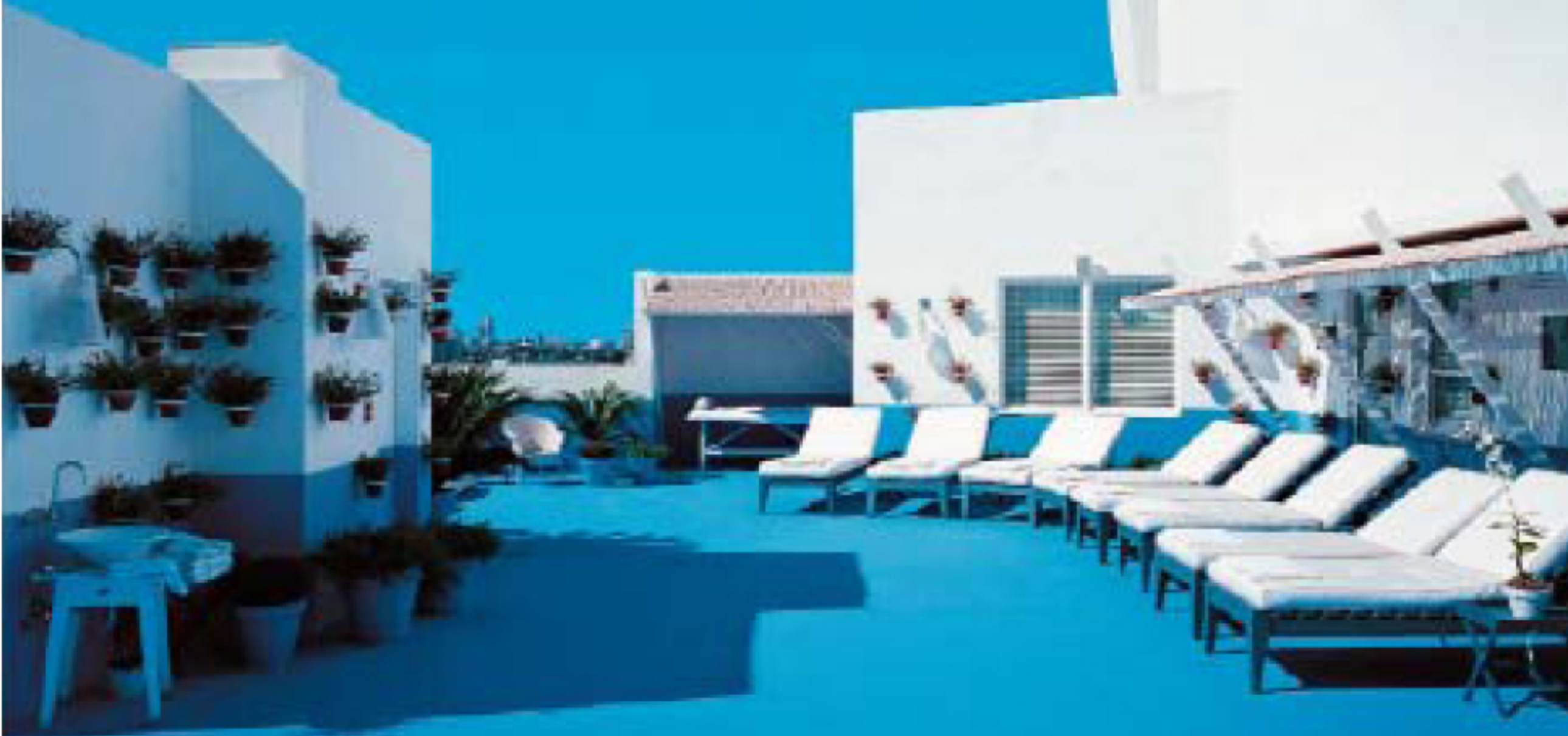
The rooftop solarium at the Delano's Agua Spa provides the perfect respite for sun-seeking guests.