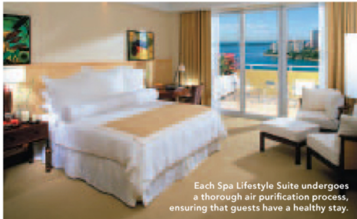
Each Spa Lifestyle Suite undergoes a thorough air purification process, ensuring that guests have a healthy stay.