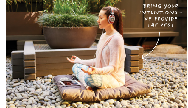
BRING YOUR INTENTIONS— WE PROVIDE THE REST

Experience a moment of tranquility at our portable MEDITATION STATION . We provide headphones, an iPad with guided meditation exercises and calming music, an oversized pillow, and a soothing face mist. Find a quiet corner to reflect or set up in our Meditation Garden for a breath of fresh air. Reserve your station at the Front Desk.