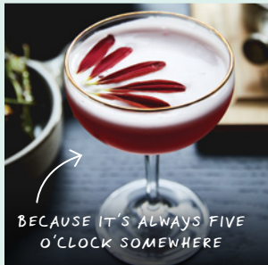
BECAUSE IT'S ALWAYS FIVE O'CLOCK SOMEWHERE